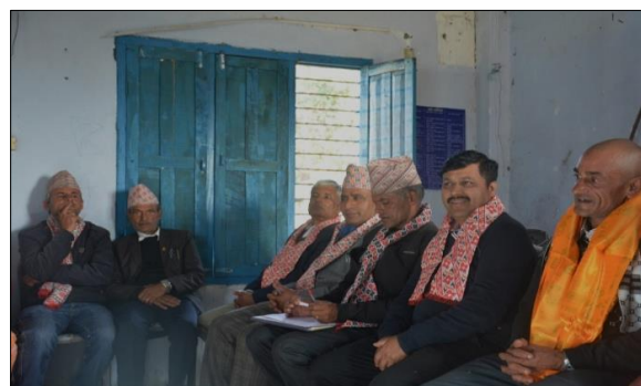
Fig. (k) Local government official along with NELUMBO, NEPAL's representative