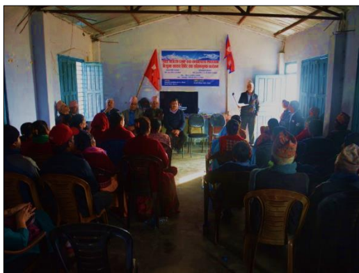
Fig. (i) Awareness program at community hall

The certificate of appreciation was distributed by the chief guest to all the volunteers of the program.