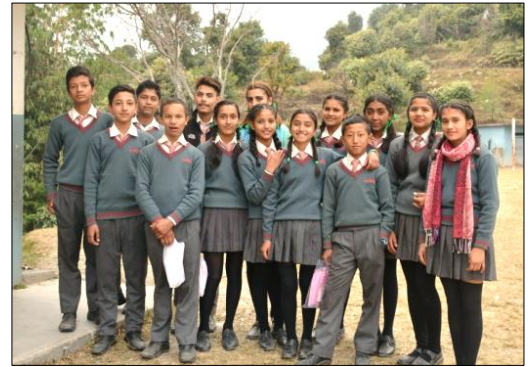
Fig. (j) Red Cross Youth Volunteers