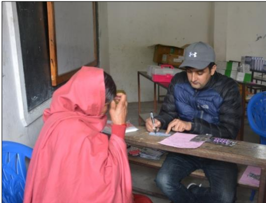
Fig. (g) Medicine distribution as per the prescription