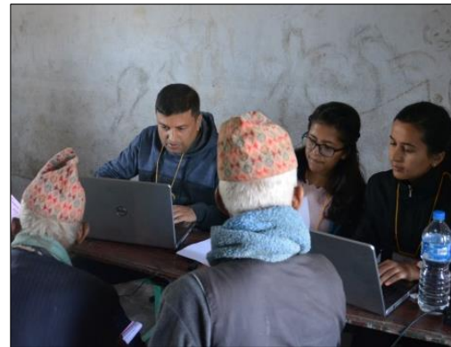
Fig. (f) Data collection