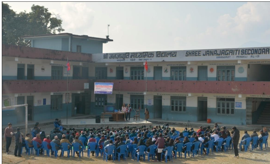
Fig. (k) Teachers and students attending the awareness program at the school premises