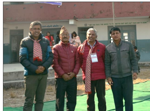
Fig. (m) Participants during the awareness program