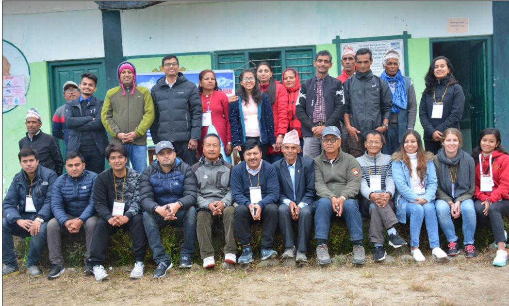
Fig. (I): Volunteers from NELUMBO, NEPAL, Local health community and Sharing-minds