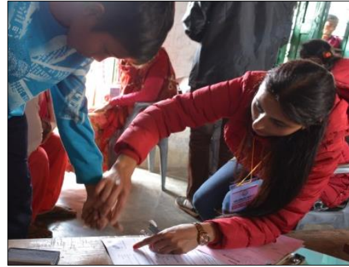
Fig. (d) Registration during Health Camps