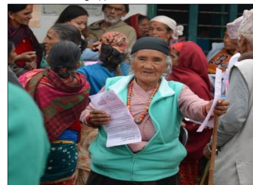
Fig. (h) Community people for health check up