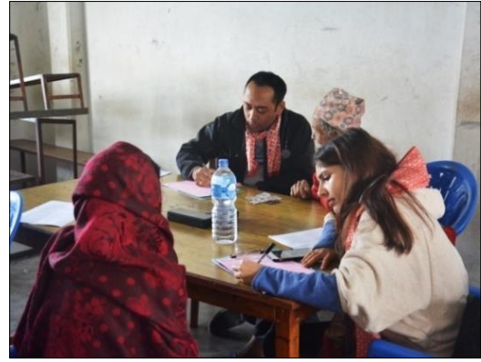
Fig. (f) General Medical Check-up