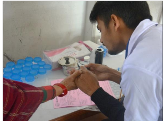
Fig. (h) Lab test