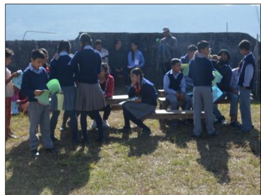
Fig. (j) Students participants during awareness program