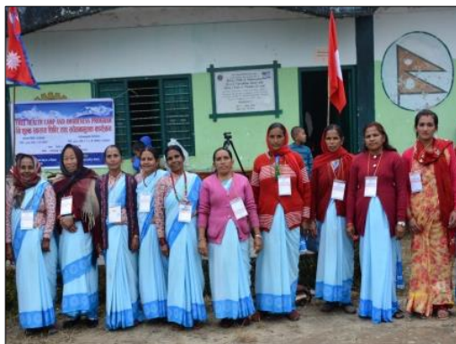
Fig. (a) Female Community Health Volunteers

Likewise, data collection of the individuals was done to find out their way of living and health status. The program was formally started at 10:00 am till 5 pm. A total of 225 people had been registered for the checkup. The presence and active participation of the Female Community Health Volunteer (FCHV), representatives from local government, Toile development committee and others (teacher, student) made the program more smooth and effective.