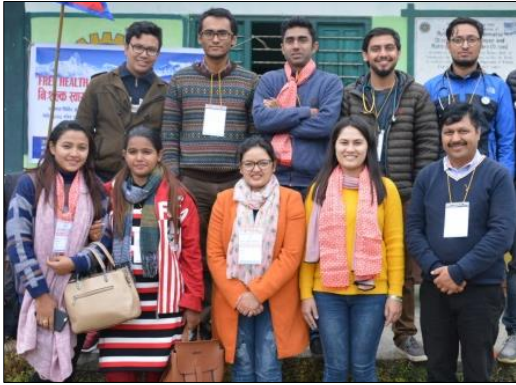
Fig. (c) Volunteers doctors from Gandaki Medical College