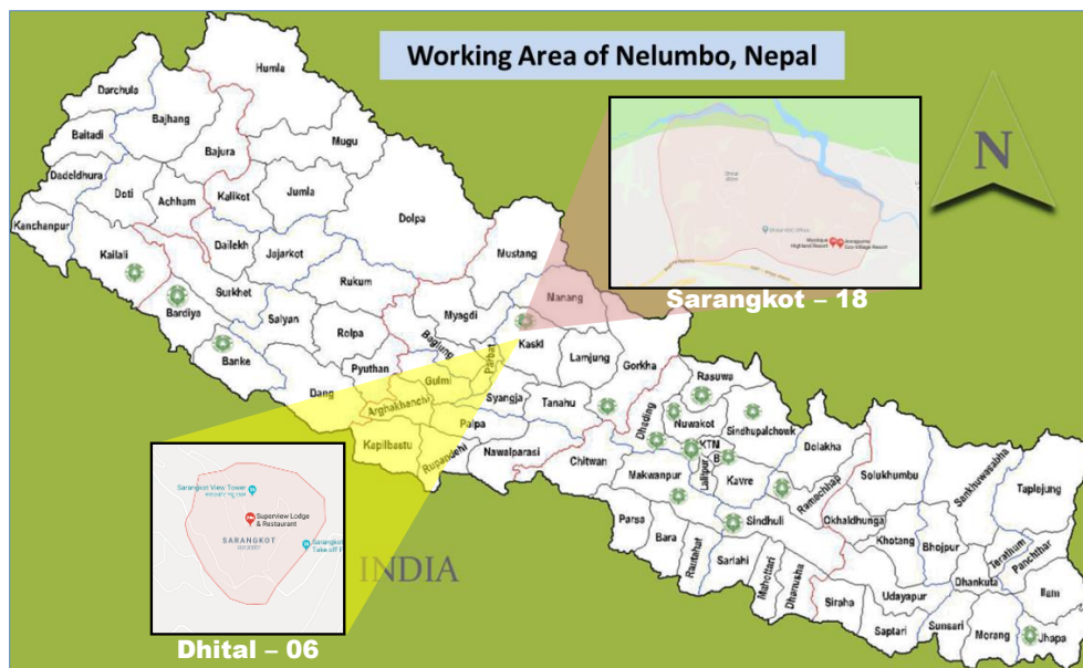
Fig. 1. Nelumbo Nepal working sites

NELUMBO, NEPAL organized free health camp and awareness programs at two different places namely, Dhital-06, Machhapurchhre Rural Municipality and Sarankot-18, Pokhara Metropolitan City on 8-9 th of Mansir and 22-23 rd of Mansir, respectively. The fundamental objectives of these camps were to run general medical camp and health related awareness programs in working areas of Nepal. The map of Nepal with its working areas (Dhital and Sarankot) is shown in Fig. 1.