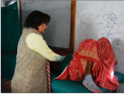
Fig. (e) Check up by Gynecologist