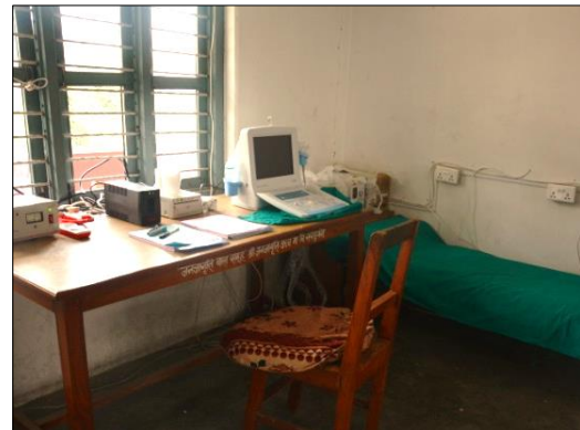
Fig. (b) Sonography during Camp