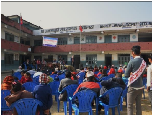
Fig. (a) Inauguration of the program by honorable member of Parliament Mr. Ramji Prasad Baral

The program started from 10:00 am till 5 pm. A total of 311 people registered for the checkup and received different available services. There was the presence and active participation of the government and local representatives. The active participation of the local volunteers made the program more smooth and effective.