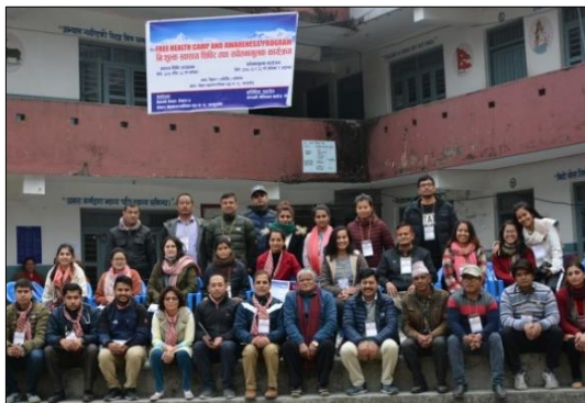
Fig. (i) Volunteers from NELUMBO Nepal and Gandaki Medical College