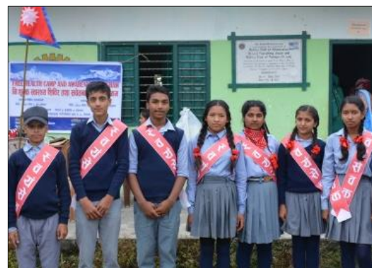
Fig. (b) Volunteers from School