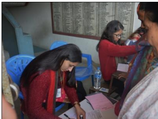
Fig. (c) Registration for checkup