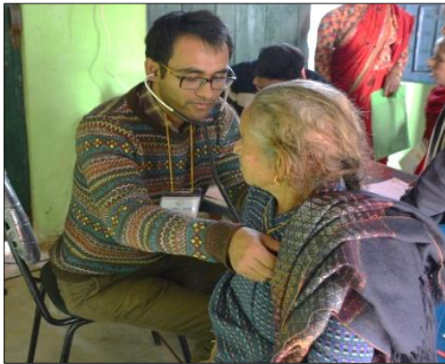
Fig. (e) Checkup during Camp