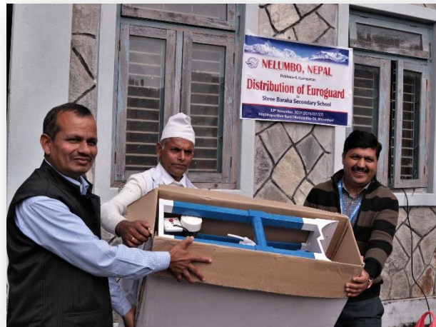
Handing over euro-guards to the representatives of Shree Baraha Secondary School, MRM-06, Bhindabari. November 13, 2019