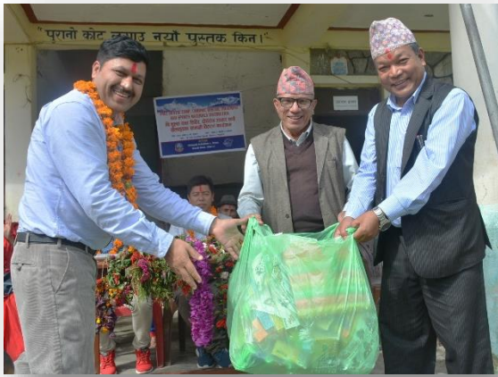
Handing over the sports materials to the representatives of Shree Baraha Secondary School, MRM-06, Bhindabari. September 25, 2019

Quality education is right of every child. As we aim to enhance the teaching and learning process and experience, we have supported schools at our working areas by providing necessary sports materials as well as euro- guards to promote safe drinking water and healthy living.