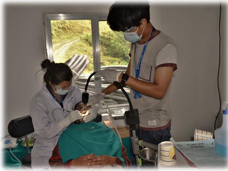
Figure 6: Dental Procedure being done in portable dental chair using portable dental scaler.