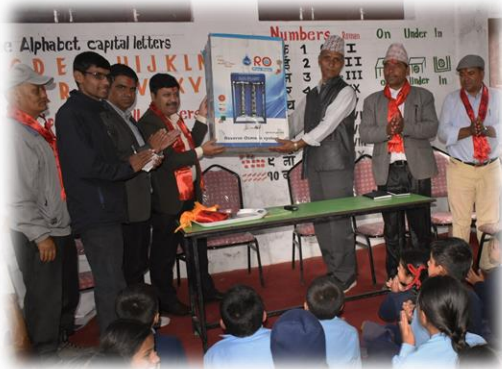
Figure 2: Handing over euro-guard to the school management committee.