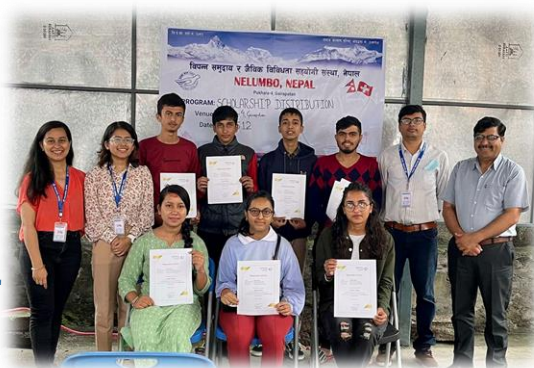
Figure 3: Students after acquiring their scholarship for higher studies by NELUMBO, NEPAL