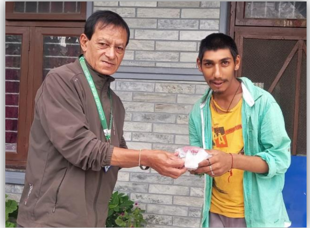
Figure 1: Medicine Handover to the Children Living with Disability in collaboration with CWSN