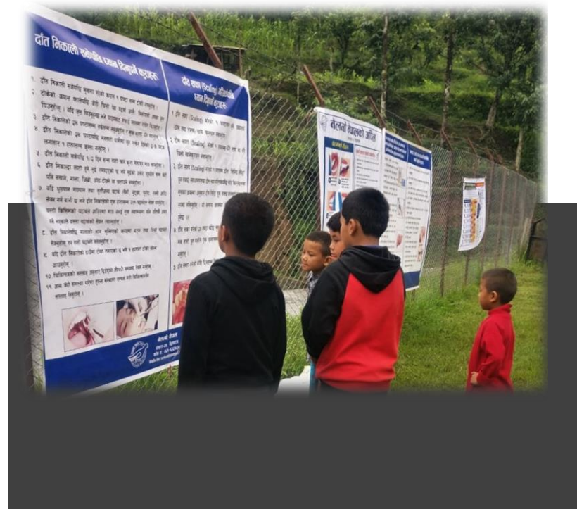
Figure 7: Children reading the infographic poster regarding the dental and oral health at one of the Dental Camps.