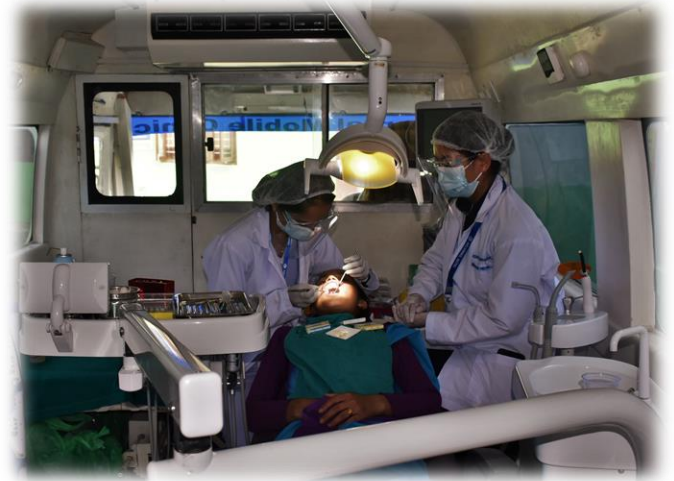
Figure 4: Dental procedure being done inside the Dental Mobile Clinic van

A total of 1,454 individual were directly benefited during these camps.